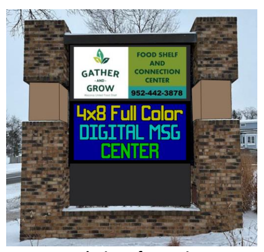
Rendering of new sign